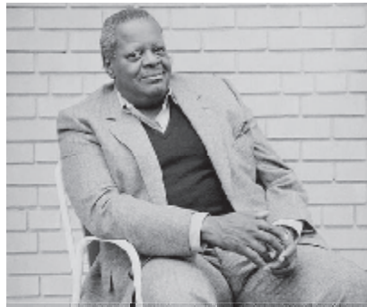
Canadian Jazz pianist Oscar Peterson died last December at the age of 82.

His unbelievable technique, harmonic sense, composing, and ability to turn "pops" and "standards" into "works of art" became his trademark.